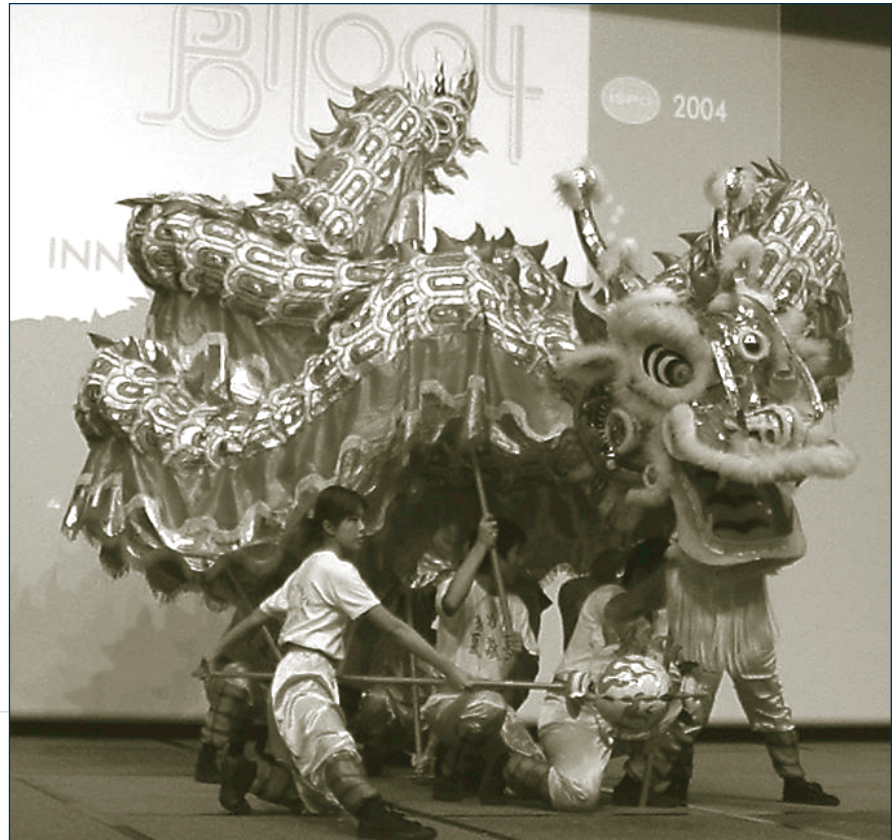
Opening Ceremony of the 11 th World Congress of the International Society for Prosthetics and Orthotics in Hong Kong

As citizens of the United States, we are at times isolated from the issues facing persons with disabilities worldwide. People with disabilities are disproportionately represented among the poorest of the poor. It was interesting to learn what organizations such as the World Health Organiza-